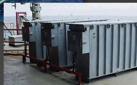
Galvotec-Lockheed VTA System