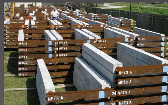
Galvotec - Dual Retrofit Assemblies